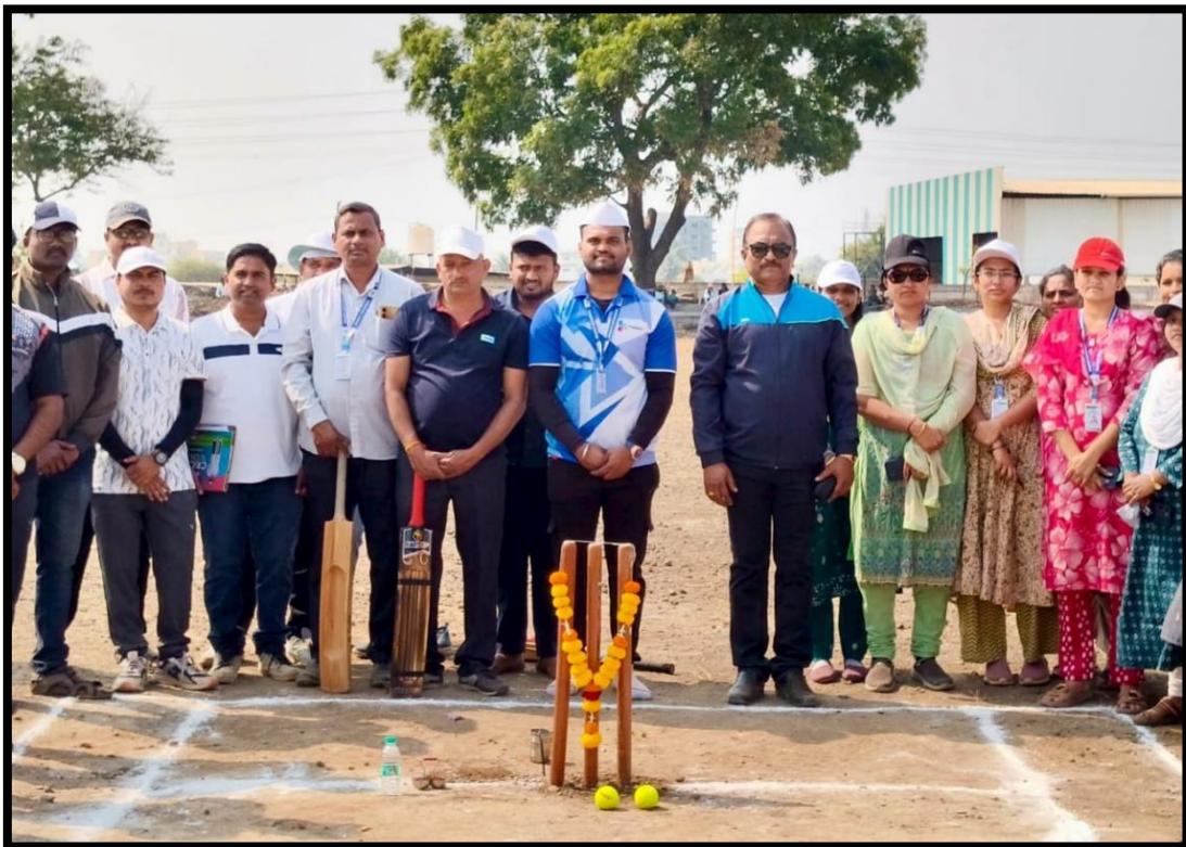
Cricket Inauguration Ceremony