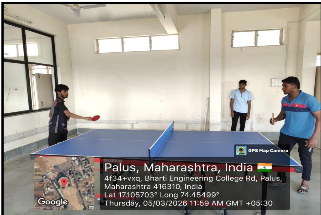
Table Tennis Competition during Annual Sports Week 2025–2026