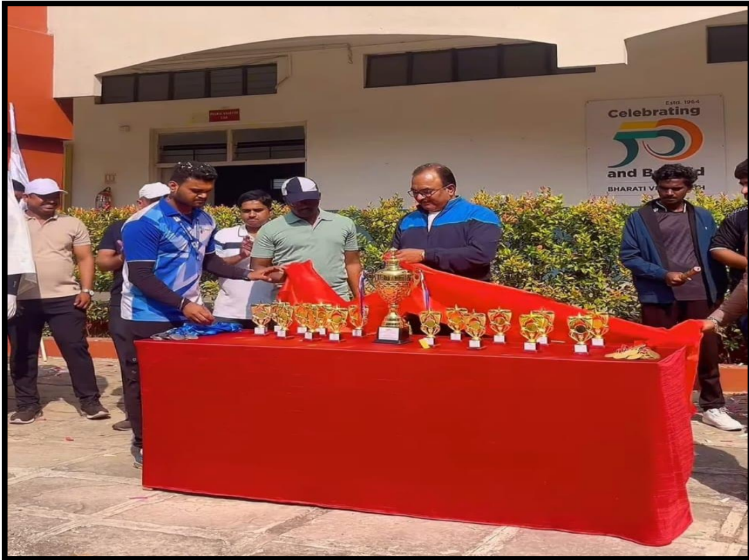
Trophy Unveiling Ceremony