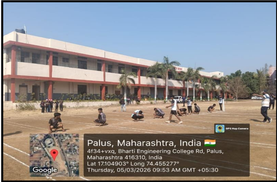
Kho-Kho match in progress during Annual Sports 2K26