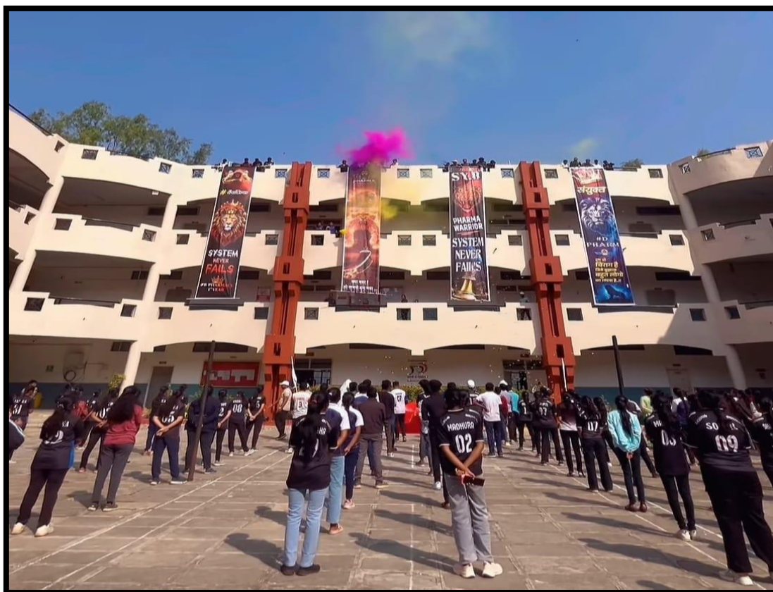
Sports Week Flyer Unveiling Ceremony

The Annual Sports Week concluded successfully, providing students with an opportunity to showcase their athletic abilities, teamwork, and leadership qualities. The event played an important role in strengthening the spirit of unity, cooperation, and healthy competition among the students of the institution.